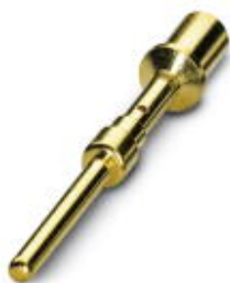
Crimp contact, turned, Single contact, contact diameter: 2 mm, crimp range: 0.25 mm 2 ... 1 mm 2

Please be informed that the data shown in this PDF Document is generated from our Online Catalog. Please find the complete data in the user's documentation. Our General Terms of Use for Downloads are valid ( http://phoenixcontact.com/download )