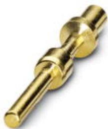
Crimp contact, turned, Single contact, contact diameter: 3.6 mm, crimp range: 4 mm 2 ... 6 mm 2

Please be informed that the data shown in this PDF Document is generated from our Online Catalog. Please find the complete data in the user's documentation. Our General Terms of Use for Downloads are valid ( http://phoenixcontact.com/download )