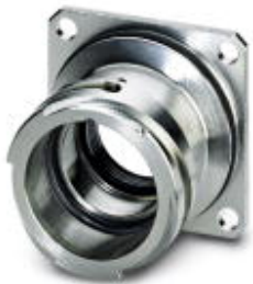
Panel mounting base, straight, Bayonet locking, M23, Radial O-ring, 4xØ3,2, Shielded: Yes, Panel thickness min.: 3.5 mm, Cable cross section: 0 mm...0 mm

Please be informed that the data shown in this PDF Document is generated from our Online Catalog. Please find the complete data in the user's documentation. Our General Terms of Use for Downloads are valid ( http://download.phoenixcontact.com )