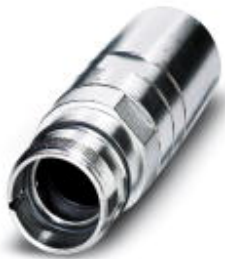
Sleeve housing for coupler connector, straight, Screw locking, M23, Shielded: Yes, Cable cross section: 6.5 mm...14.5 mm

Please be informed that the data shown in this PDF Document is generated from our Online Catalog. Please find the complete data in the user's documentation. Our General Terms of Use for Downloads are valid ( http://download.phoenixcontact.com )