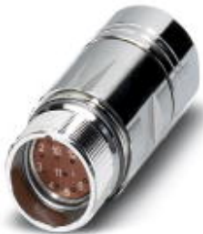
Coupler connector, straight, Screw locking, M23, Number of positions: 17, Type of contact: Socket, Crimp connection, Shielded: Yes, Cable cross section: 6 mm...10 mm

Please be informed that the data shown in this PDF Document is generated from our Online Catalog. Please find the complete data in the user's documentation. Our General Terms of Use for Downloads are valid ( http://download.phoenixcontact.com )