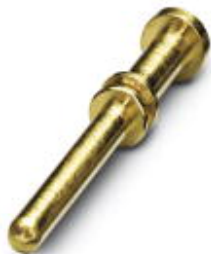
Crimp contact, turned, contact diameter: 2 mm, crimp range: 0.75 mm 2 ... 1.5 mm 2

Please be informed that the data shown in this PDF Document is generated from our Online Catalog. Please find the complete data in the user's documentation. Our General Terms of Use for Downloads are valid ( http://phoenixcontact.com/download )