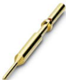
Crimp contact, turned, contact diameter: 0.6 mm, crimp range: 0.06 mm 2 ... 0.25 mm 2

Please be informed that the data shown in this PDF Document is generated from our Online Catalog. Please find the complete data in the user's documentation. Our General Terms of Use for Downloads are valid ( http://phoenixcontact.com/download )