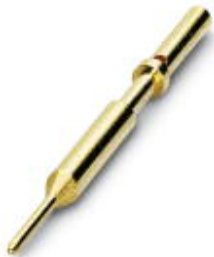
Crimp contact, turned, Contact diameter: 0.6 mm, Crimp range: 0.34 mm 2 ...0.5 mm 2

Please be informed that the data shown in this PDF Document is generated from our Online Catalog. Please find the complete data in the user's documentation. Our General Terms of Use for Downloads are valid ( http://download.phoenixcontact.com )