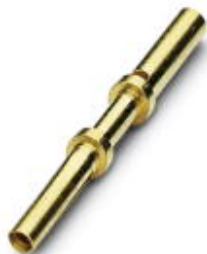
Crimp contact, turned, contact diameter: 0.6 mm, crimp range: 0.34 mm² ... 0.5 mm²

Please be informed that the data shown in this PDF Document is generated from our Online Catalog. Please find the complete data in the user's documentation. Our General Terms of Use for Downloads are valid ( http://phoenixcontact.com/download )