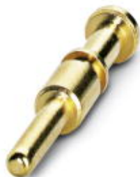
Crimp contact, turned, contact diameter: 2 mm, crimp range: 0.25 mm 2 ... 1 mm 2

Please be informed that the data shown in this PDF Document is generated from our Online Catalog. Please find the complete data in the user's documentation. Our General Terms of Use for Downloads are valid ( http://phoenixcontact.com/download )