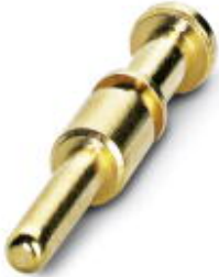
Crimp contact, turned, Single contact, contact diameter: 2 mm, crimp range: 1 mm 2 ... 2.5 mm 2

Please be informed that the data shown in this PDF Document is generated from our Online Catalog. Please find the complete data in the user's documentation. Our General Terms of Use for Downloads are valid ( http://phoenixcontact.com/download )