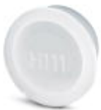
Plastic dust protection cap for connectors with M17 knurled nuts and M17 Speedcon knurled nuts

Plastic dust protection cap - ST-Z0007 - 1607777