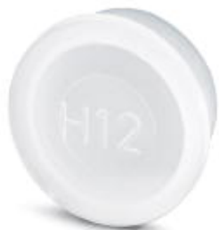
Plastic dust protection cap for connectors with M17 external thread

Please be informed that the data shown in this PDF Document is generated from our Online Catalog. Please find the complete data in the user's documentation. Our General Terms of Use for Downloads are valid ( http://phoenixcontact.com/download )