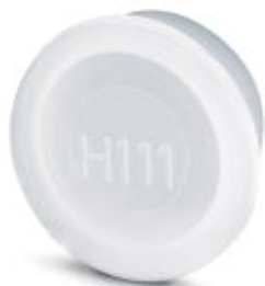
The figure shows the product version for M23 circular connectors

Plastic dust protection cap for connectors with M17 knurled nuts and M17 Speedcon knurled nuts