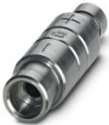
Crimp head positioner

Please be informed that the data shown in this PDF Document is generated from our Online Catalog. Please find the complete data in the user's documentation. Our General Terms of Use for Downloads are valid ( http://phoenixcontact.com/download )