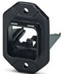
RJ45 panel mounting frame, IP67, for push-pull interlocking, plastic, with the Freenet system, for square panel cutout, with grommet, without mounting screws

Please be informed that the data shown in this PDF Document is generated from our Online Catalog. Please find the complete data in the user's documentation. Our General Terms of Use for Downloads are valid ( http://download.phoenixcontact.com )