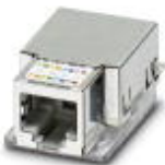
RJ45 socket insert, for the Freenet system, CAT5e, 8-pos., shielded, with cable connection (IDC fast connection), for solid wires AWG 24 ... 22

RJ45 female insert - VS-08-BU-RJ45-5-F/PK - 1652936