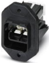
SCRJ panel mounting frame, IP67, for push/pull interlocking, plastic, with the Freenet system, for square mounting cutout, with seal and SCRJ coupling, without mounting screws

Please be informed that the data shown in this PDF Document is generated from our Online Catalog. Please find the complete data in the user's documentation. Our General Terms of Use for Downloads are valid ( http://download.phoenixcontact.com )