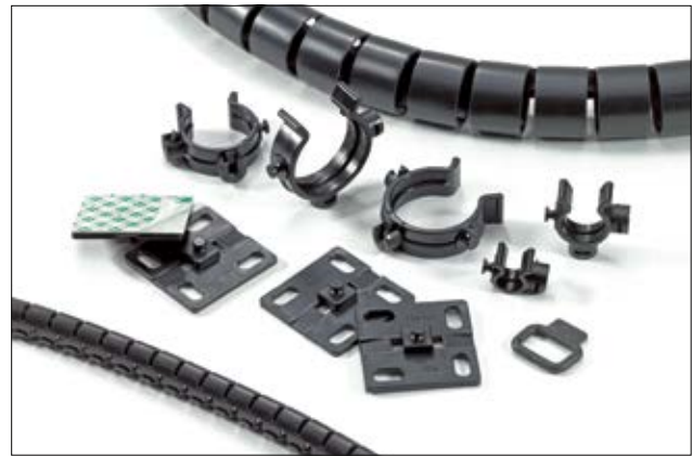
The Helawrap accessory set for bundling, fixing and protecting multiple cable runs.