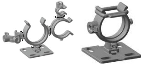
Multiple clips can be joined. Clips swivel freely.