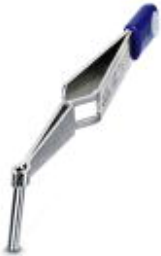
Positioning and unlocking tool for RC crimp contacts (D-SUB) for pin/socket, diameter: 2 mm

Please be informed that the data shown in this PDF Document is generated from our Online Catalog. Please find the complete data in the user's documentation. Our General Terms of Use for Downloads are valid ( http://phoenixcontact.com/download )