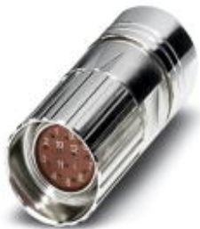
Cable connector, straight, Screw locking, M23, Number of positions: 16, Type of contact: Socket, Crimp connection, Shielded: Yes, Cable cross section: 5 mm...13.2 mm

Please be informed that the data shown in this PDF Document is generated from our Online Catalog. Please find the complete data in the user's documentation. Our General Terms of Use for Downloads are valid ( http://download.phoenixcontact.com )