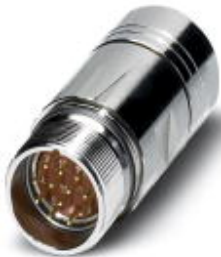
Coupler connector, straight, Screw locking, M23, Number of positions: 16, Type of contact: Male connector, Crimp connection, Shielded: Yes, Cable cross section: 5 mm...13.2 mm

Please be informed that the data shown in this PDF Document is generated from our Online Catalog. Please find the complete data in the user's documentation. Our General Terms of Use for Downloads are valid ( http://download.phoenixcontact.com )