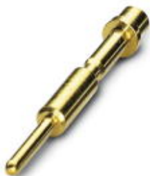
Crimp contact, turned, Single contact, contact diameter: 1 mm, crimp range: 0.06 mm 2 ... 0.25 mm 2

Please be informed that the data shown in this PDF Document is generated from our Online Catalog. Please find the complete data in the user's documentation. Our General Terms of Use for Downloads are valid ( http://phoenixcontact.com/download )