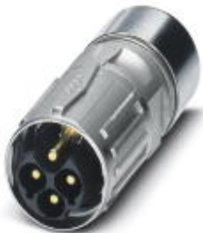
Cable connector, straight, SPEEDCON locking, M17, Number of positions: 5+PE, Type of contact: Male connector, Crimp connection, shielded: yes, Cable diameter: 9 mm...11.2 mm

Please be informed that the data shown in this PDF Document is generated from our Online Catalog. Please find the complete data in the user's documentation. Our General Terms of Use for Downloads are valid ( http://phoenixcontact.com/download )