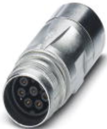
Coupler connector, straight, SPEEDCON locking, M17, Number of positions: 5+3+PE, Type of contact: Socket, Crimp connection, shielded: yes, Cable diameter: 9 mm...11.2 mm

Please be informed that the data shown in this PDF Document is generated from our Online Catalog. Please find the complete data in the user's documentation. Our General Terms of Use for Downloads are valid ( http://phoenixcontact.com/download )