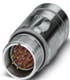
Coupling connector, straight, shielded: yes, SPEEDCON locking, M23, No. of pos.: 17, type of contact: Pin, Crimp connection, cable diameter range: 4 mm ... 6 mm

Please be informed that the data shown in this PDF Document is generated from our Online Catalog. Please find the complete data in the user's documentation. Our General Terms of Use for Downloads are valid ( http://phoenixcontact.com/download )