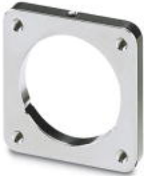
Square mounting flange, 4xM3, flange dimensions: 38 mm x 38 mm

Please be informed that the data shown in this PDF Document is generated from our Online Catalog. Please find the complete data in the user's documentation. Our General Terms of Use for Downloads are valid ( http://phoenixcontact.com/download )