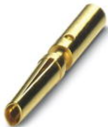
Crimp contact, turned, Contact diameter: 0.8 mm, Crimp range: 0.08 mm²...0.25 mm²

Please be informed that the data shown in this PDF Document is generated from our Online Catalog. Please find the complete data in the user's documentation. Our General Terms of Use for Downloads are valid ( http://phoenixcontact.com/download )