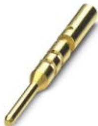
Crimp contact, turned, Contact diameter: 0.8 mm, Crimp range: 0.08 mm 2 ...0.25 mm 2

Please be informed that the data shown in this PDF Document is generated from our Online Catalog. Please find the complete data in the user's documentation. Our General Terms of Use for Downloads are valid ( http://phoenixcontact.com/download )