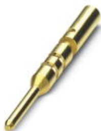
Crimp contact, turned, Contact diameter: 0.8 mm, Crimp range: 0.34 mm 2 ...0.5 mm 2

Please be informed that the data shown in this PDF Document is generated from our Online Catalog. Please find the complete data in the user's documentation. Our General Terms of Use for Downloads are valid ( http://phoenixcontact.com/download )