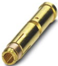
Crimp contact, turned, Contact diameter: 2 mm, Crimp range: 2.5 mm 2 ...4 mm 2

Please be informed that the data shown in this PDF Document is generated from our Online Catalog. Please find the complete data in the user's documentation. Our General Terms of Use for Downloads are valid ( http://phoenixcontact.com/download )