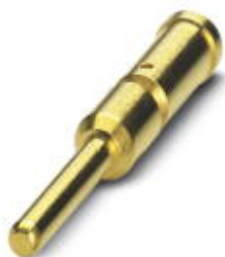
Crimp contact, turned, Contact diameter: 2 mm, Crimp range: 2.5 mm²...4 mm²

Please be informed that the data shown in this PDF Document is generated from our Online Catalog. Please find the complete data in the user's documentation. Our General Terms of Use for Downloads are valid ( http://phoenixcontact.com/download )