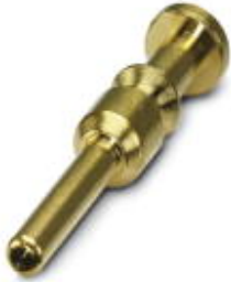
Crimp contact, turned, contact diameter: 3.6 mm, crimp range: 2.5 mm 2 ... 4 mm 2

Please be informed that the data shown in this PDF Document is generated from our Online Catalog. Please find the complete data in the user's documentation. Our General Terms of Use for Downloads are valid ( http://phoenixcontact.com/download )