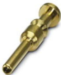
Crimp contact, turned, Single contact, contact diameter: 3.6 mm, crimp range: 4 mm 2 ... 6 mm 2

Please be informed that the data shown in this PDF Document is generated from our Online Catalog. Please find the complete data in the user's documentation. Our General Terms of Use for Downloads are valid ( http://phoenixcontact.com/download )