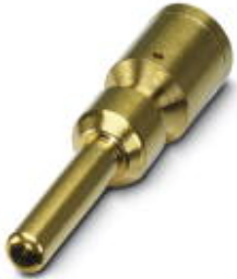
Crimp contact, turned, Single contact, contact diameter: 3.6 mm, crimp range: 16 mm 2 ... 16 mm 2

Please be informed that the data shown in this PDF Document is generated from our Online Catalog. Please find the complete data in the user's documentation. Our General Terms of Use for Downloads are valid ( http://phoenixcontact.com/download )