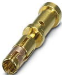
Crimp contact, turned, contact diameter: 1 mm, crimp range: 0.06 mm 2 ... 0.25 mm 2

Please be informed that the data shown in this PDF Document is generated from our Online Catalog. Please find the complete data in the user's documentation. Our General Terms of Use for Downloads are valid ( http://phoenixcontact.com/download )