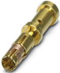
Crimp contact, turned, contact diameter: 1 mm, crimp range: 0.34 mm 2 ... 0.5 mm 2

Please be informed that the data shown in this PDF Document is generated from our Online Catalog. Please find the complete data in the user's documentation. Our General Terms of Use for Downloads are valid ( http://phoenixcontact.com/download )