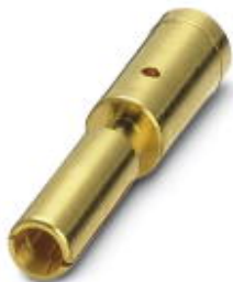
Crimp contact, turned, contact diameter: 1 mm, crimp range: 1 mm 2 ... 1.5 mm 2

Please be informed that the data shown in this PDF Document is generated from our Online Catalog. Please find the complete data in the user's documentation. Our General Terms of Use for Downloads are valid ( http://phoenixcontact.com/download )