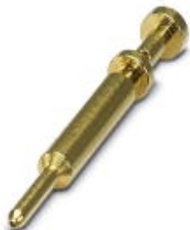
Crimp contact, turned, contact diameter: 1 mm, crimp range: 0.06 mm 2 ... 0.25 mm 2

Please be informed that the data shown in this PDF Document is generated from our Online Catalog. Please find the complete data in the user's documentation. Our General Terms of Use for Downloads are valid ( http://phoenixcontact.com/download )