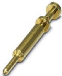
Crimp contact, turned, contact diameter: 1 mm, crimp range: 0.34 mm 2 ... 0.5 mm 2

Please be informed that the data shown in this PDF Document is generated from our Online Catalog. Please find the complete data in the user's documentation. Our General Terms of Use for Downloads are valid ( http://phoenixcontact.com/download )