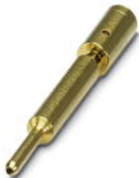
Crimp contact, turned, Single contact, contact diameter: 1 mm, crimp range: 0.5 mm 2 ... 1 mm 2

Please be informed that the data shown in this PDF Document is generated from our Online Catalog. Please find the complete data in the user's documentation. Our General Terms of Use for Downloads are valid ( http://phoenixcontact.com/download )