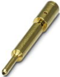
Crimp contact, turned, Single contact, contact diameter: 1 mm, crimp range: 1 mm 2 ... 1.5 mm 2

Please be informed that the data shown in this PDF Document is generated from our Online Catalog. Please find the complete data in the user's documentation. Our General Terms of Use for Downloads are valid ( http://phoenixcontact.com/download )