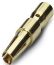
Crimp contact, turned, contact diameter: 1.5 mm, crimp range: 0.5 mm 2 ... 1 mm 2

Please be informed that the data shown in this PDF Document is generated from our Online Catalog. Please find the complete data in the user's documentation. Our General Terms of Use for Downloads are valid ( http://phoenixcontact.com/download )