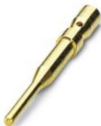
Crimp contact, turned, contact diameter: 1 mm, crimp range: 0.14 mm 2 ... 0.56 mm 2

Please be informed that the data shown in this PDF Document is generated from our Online Catalog. Please find the complete data in the user's documentation. Our General Terms of Use for Downloads are valid ( http://phoenixcontact.com/download )