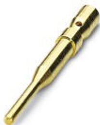
Crimp contact, turned, contact diameter: 1 mm, crimp range: 0.5 mm 2 ... 1 mm 2

Please be informed that the data shown in this PDF Document is generated from our Online Catalog. Please find the complete data in the user's documentation. Our General Terms of Use for Downloads are valid ( http://phoenixcontact.com/download )