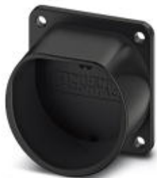
Retainer for Vehicle Connector as parking position at charging stations (EVSE), Type 2, IEC 62196-2, Front mounting

Please be informed that the data shown in this PDF Document is generated from our Online Catalog. Please find the complete data in the user's documentation. Our General Terms of Use for Downloads are valid ( http://phoenixcontact.com/download )