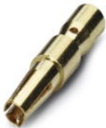
Crimp contact, turned, contact diameter: 1.5 mm, crimp range: 0.08 mm 2 ... 0.22 mm 2

Please be informed that the data shown in this PDF Document is generated from our Online Catalog. Please find the complete data in the user's documentation. Our General Terms of Use for Downloads are valid ( http://phoenixcontact.com/download )