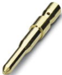
Crimp contact, turned, contact diameter: 1.5 mm, crimp range: 0.08 mm 2 ... 0.22 mm 2

Please be informed that the data shown in this PDF Document is generated from our Online Catalog. Please find the complete data in the user's documentation. Our General Terms of Use for Downloads are valid ( http://phoenixcontact.com/download )