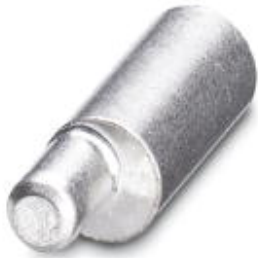
Cable lug for HEAVYCON-MODULAR; PE connection extension to 16 mm 2 , for crimping with crimp pliers

Please be informed that the data shown in this PDF Document is generated from our Online Catalog. Please find the complete data in the user's documentation. Our General Terms of Use for Downloads are valid ( http://phoenixcontact.com/download )