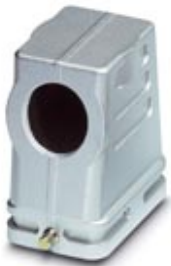
HEAVYCON sleeve housing B6, for single locking latch, height 70 mm, with thread M32, lateral cable outlet, EMC version

Please be informed that the data shown in this PDF Document is generated from our Online Catalog. Please find the complete data in the user's documentation. Our General Terms of Use for Downloads are valid ( http://download.phoenixcontact.com )