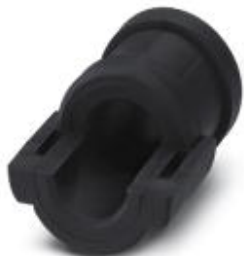
Cable feed-through sleeves, for cable diameters of 8 - 9 mm, a cable binder can be used as strain relief

Please be informed that the data shown in this PDF Document is generated from our Online Catalog. Please find the complete data in the user's documentation. Our General Terms of Use for Downloads are valid ( http://phoenixcontact.com/download )